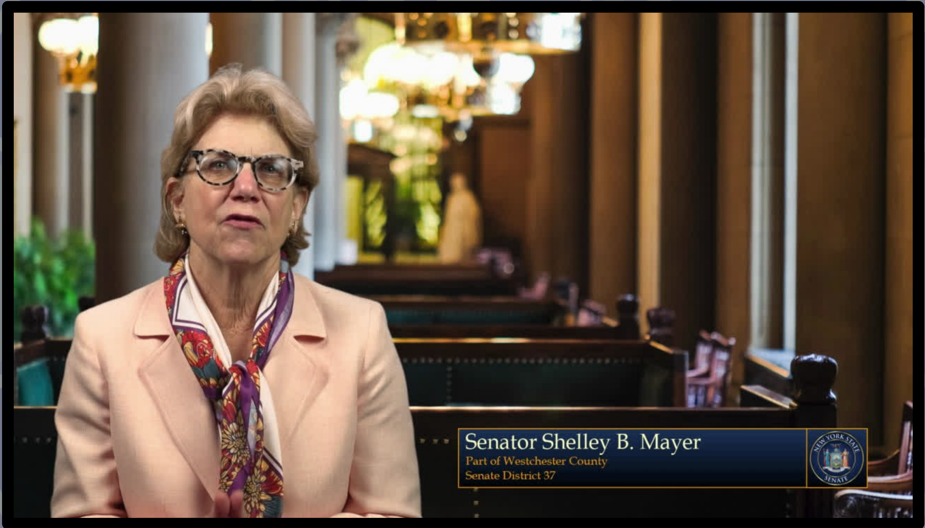
Senator Shelley B. Mayer Part of Westchester County Senate District 37